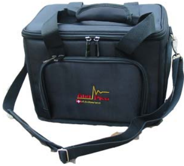
Hand Carry Bag